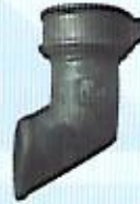
Shoe with ear