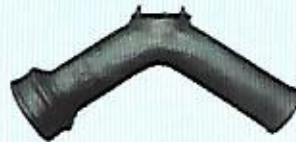
Long Plug Bend