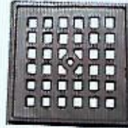
Jally with Frame

Size : 200x200mm x 3 kg. 250x250mm x 4 kg. 300x300mm x 5 kg.