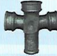
Double Door Junction

Size : 50 mm, 75mm, 100mm, 150mm 150x100mm, 150x75mm 100x75mm, 100x50mm