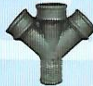
Double Plain "Y" Junction

Size : 75mm, 100mm 150x100mm, 150x75mm 100x75mm, 100x50mm