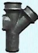
Door "Y" Junction

Size : 50 mm, 75mm, 100mm, 150mm 150x100mm, 100x75mm