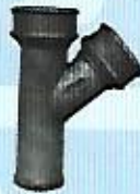
Plain "Y" Junction

Size : 50 mm, 75mm, 100mm, 150mm 150x100mm, 100x75mm, 100x50mm