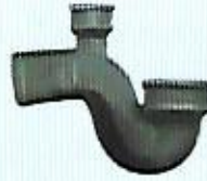
P-Trap with Vent