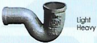
CPWD Nahani Trap