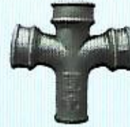
Double Plain Junction

Size : 50 mm, 75mm, 100mm, 150mm 150x100mm, 100x75mm, 100x50mm