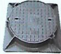
Circular Cover with Frame

Size Weight 500 mm - 75 kg, 100 kg, 116 kg 560 mm - 116 Kg, 128 kg, 208 kg