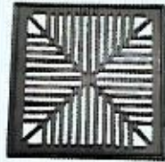
Grate and Frame

Size : 300x300mm x 11 kg. 450x450mm x 26 kg.