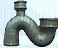
S-Trap with Vent