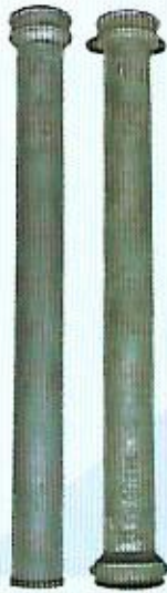
Single Socket Double Socket