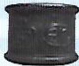
Socket / Collar