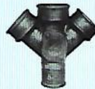
Double Door "Y" Junction

Size : 50 mm, 75mm, 100mm, 150mm 150x100mm, 100x75mm